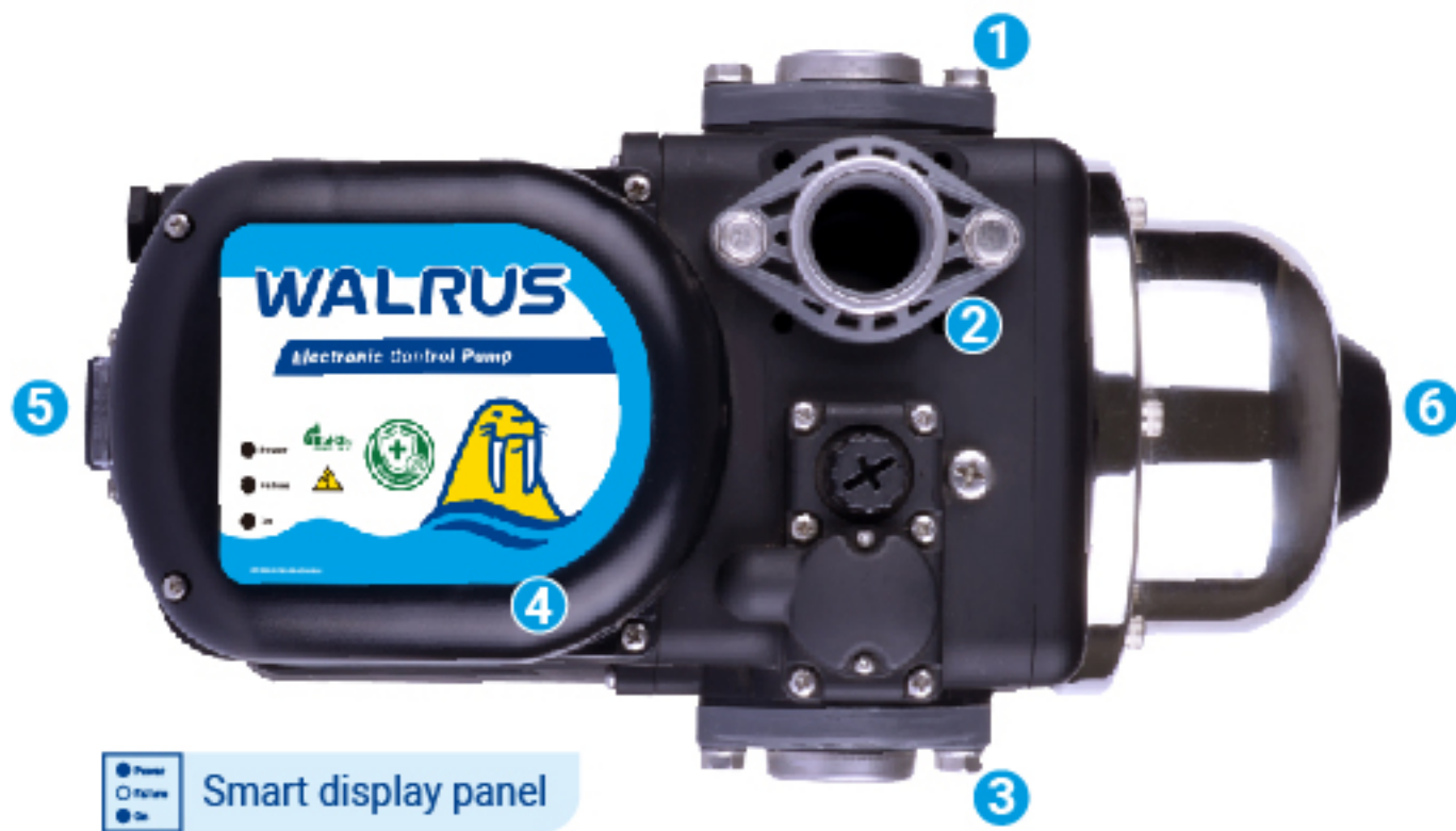
Smart display panel

Smart display panel Real-time monitoring of operation status.