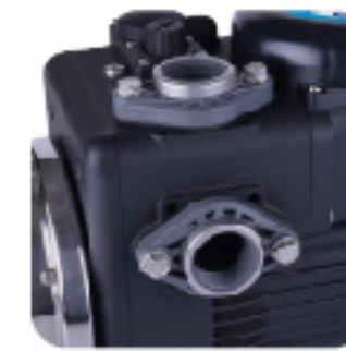
Horizontal & Vertical outlets